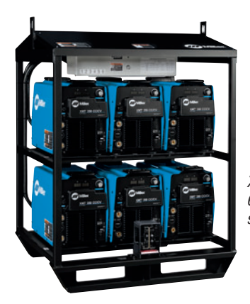
XMT 350 6-pack shown.