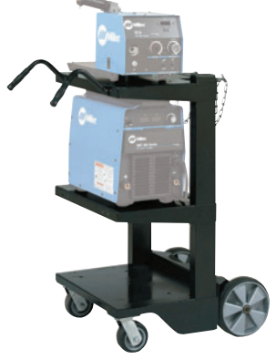
MIGRunner™ Cart #195 445 For single feeders

For detailed information on customized inverter rack systems see Lit. Index No. DC/18.81.