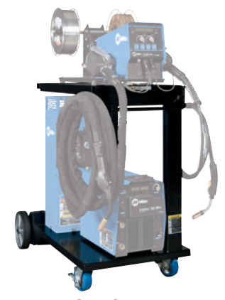
Running Gear Cylinder Rack

Note: Not compatible with dual wire feeders.