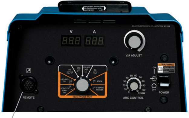
XMT 450 CC/CV panel shown

Optional Welding Intelligence™ system. XMT CC/CV and MPa models are Insight capable to monitor weld voltage, amperage, and arc-time and percentage.