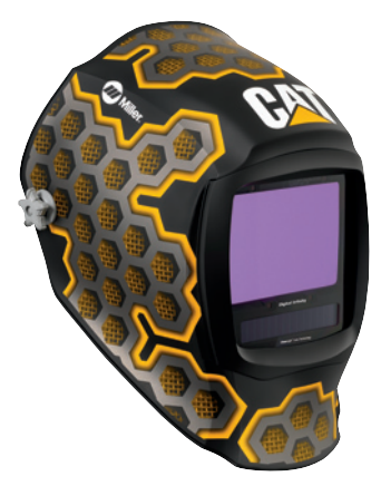
Cat® 2nd Edition 282007