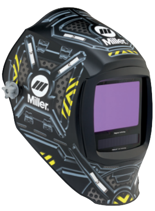
Black Ops™ 280047