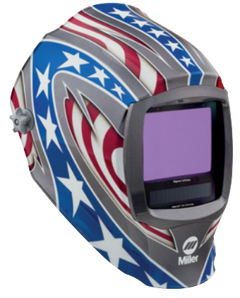
Stars and Stripes™ 280049